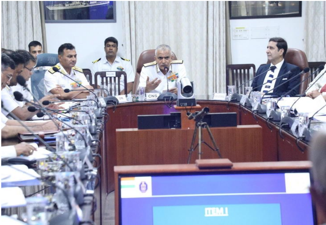
30 th AGM/ GCM of Navy Foundation held at New Delhi on 18 Jun 23