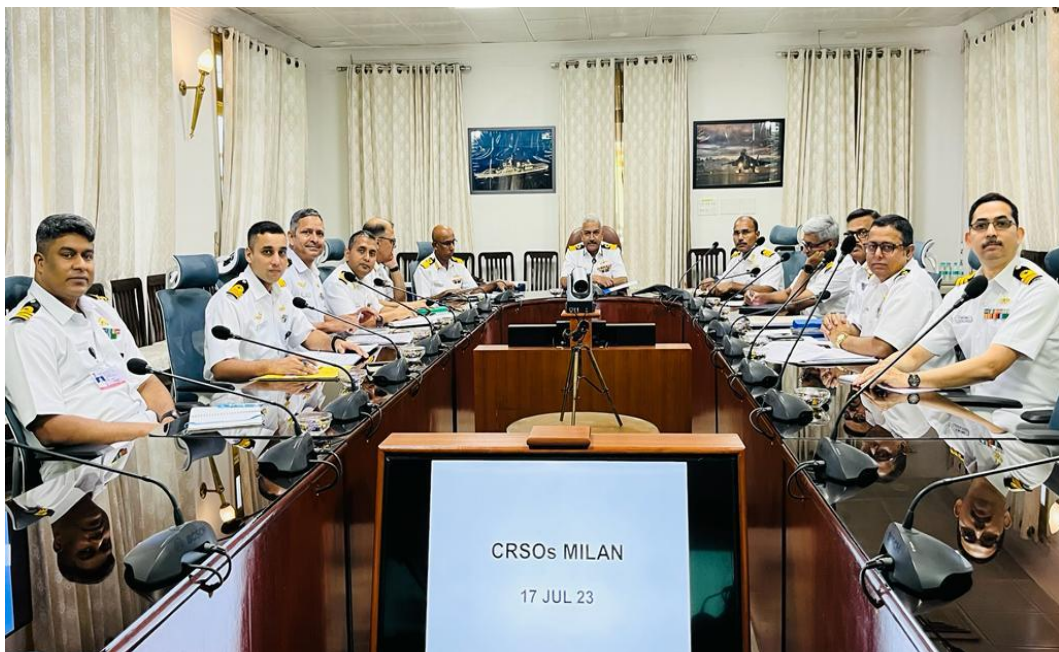
CRSOs Milan at New Delhi on 17 Jul 23