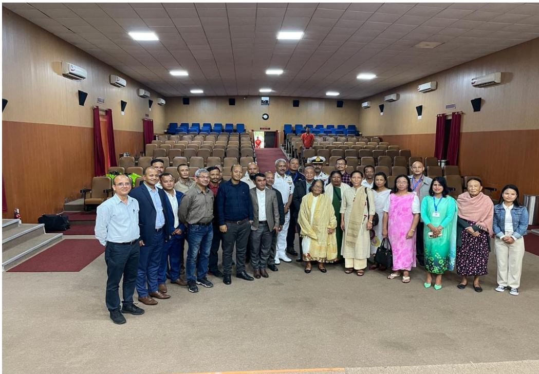
Outreach by /N Officials from DESA & CRSO (NE) held at Shillong, Meghalaya from 08 – 10 Aug 23