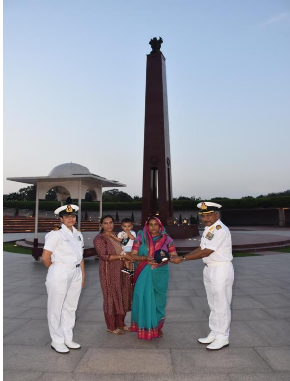
Wreath Laying Ceremony held at National War Memorial on 01 Aug 23