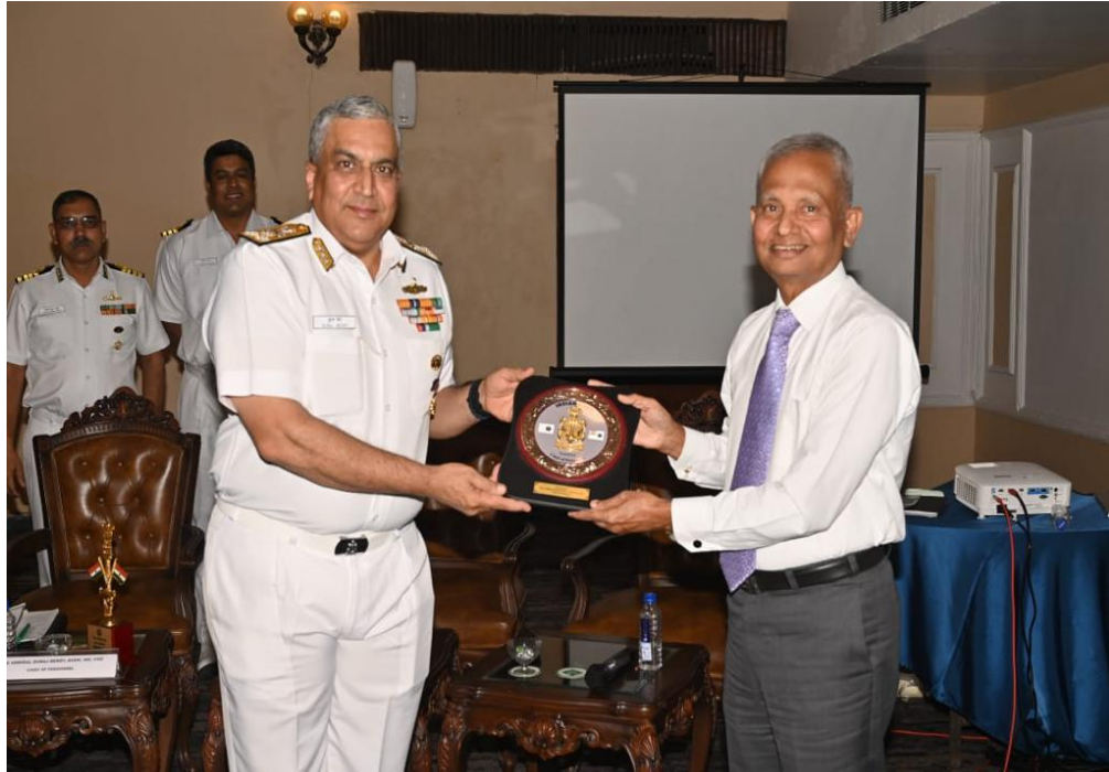
COP's Interaction with Veterans at Bhubaneswar, Odisha on 06 Aug 23