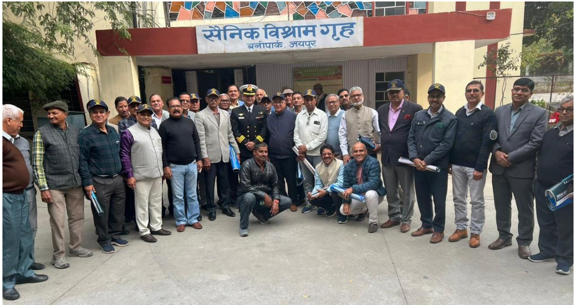
CRSO(C) Interaction with Veterans at ZSB Jaipur on 12 Feb 24