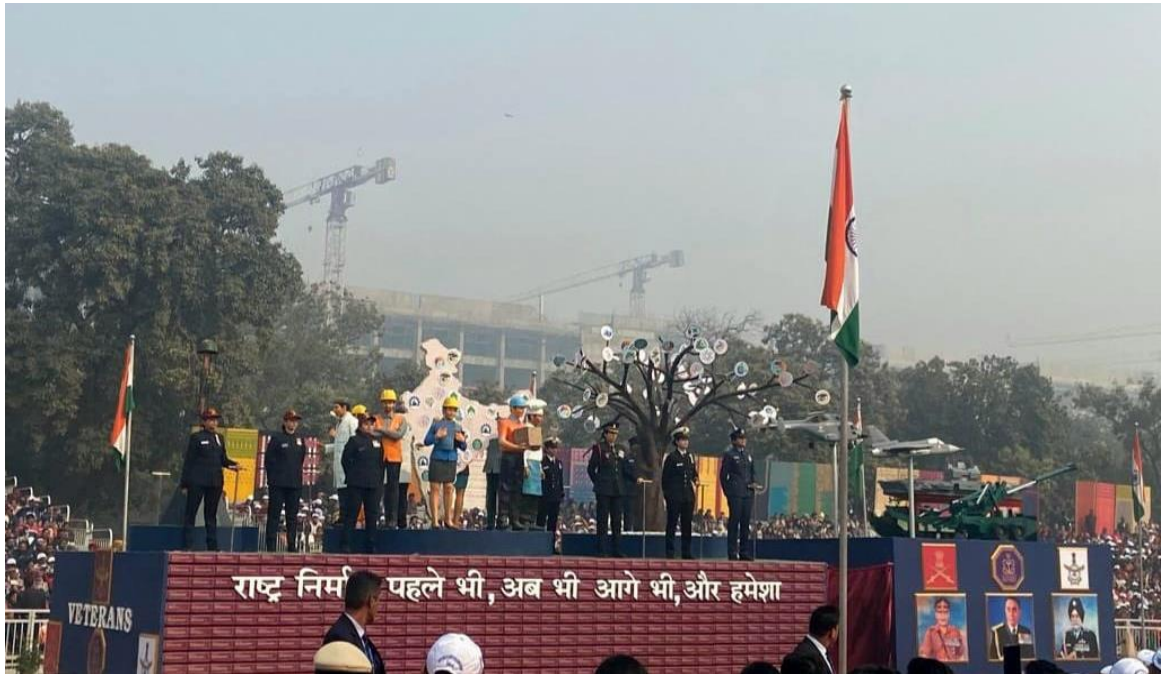
Veterans' Tableau during Republic Day Parade 2024