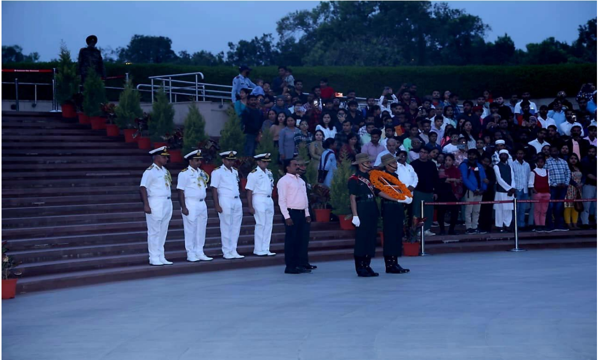
Wreath Laying Ceremony at National War Memorial (01 st of every month)