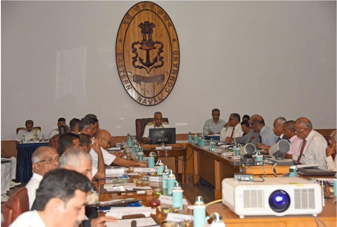
31 st AGM/ GCM of NF on 21 Mar 24 at Visakhapatnam