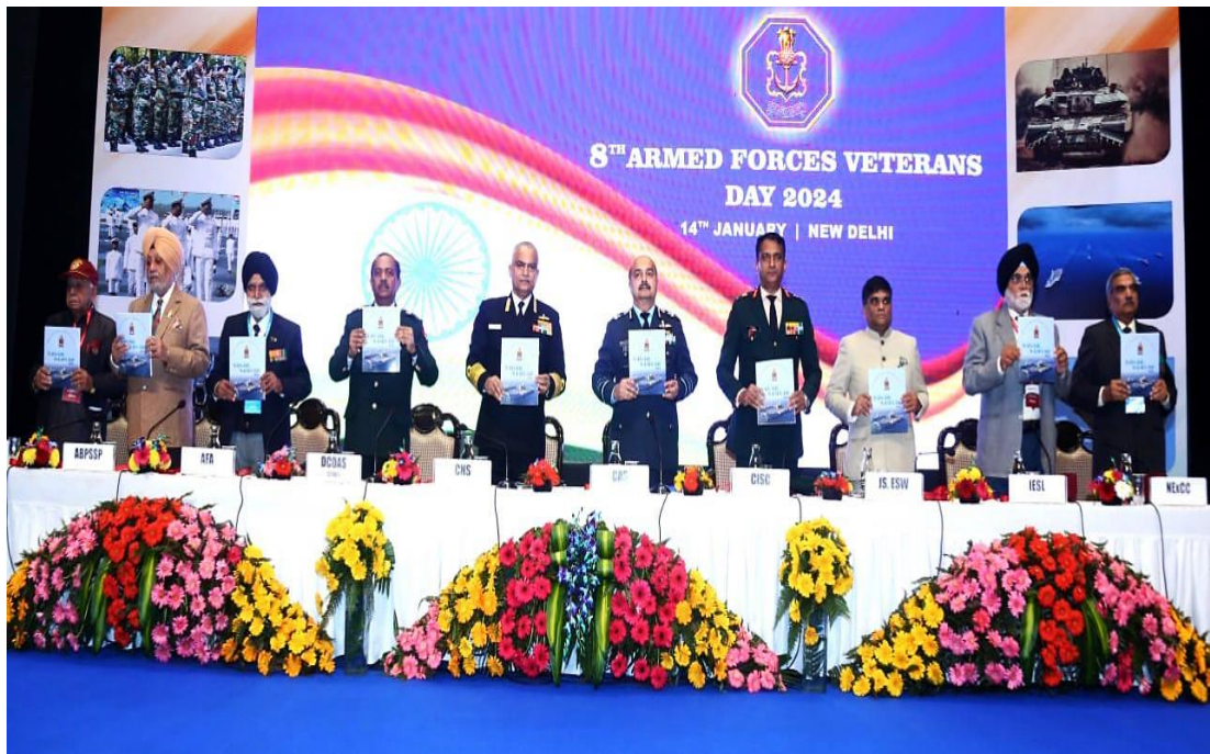
Release of 'Sagar Samvad' Magazine on 14 Jan 24 during 8 th Armed Forces Veterans' Day Celebrations at New Delhi