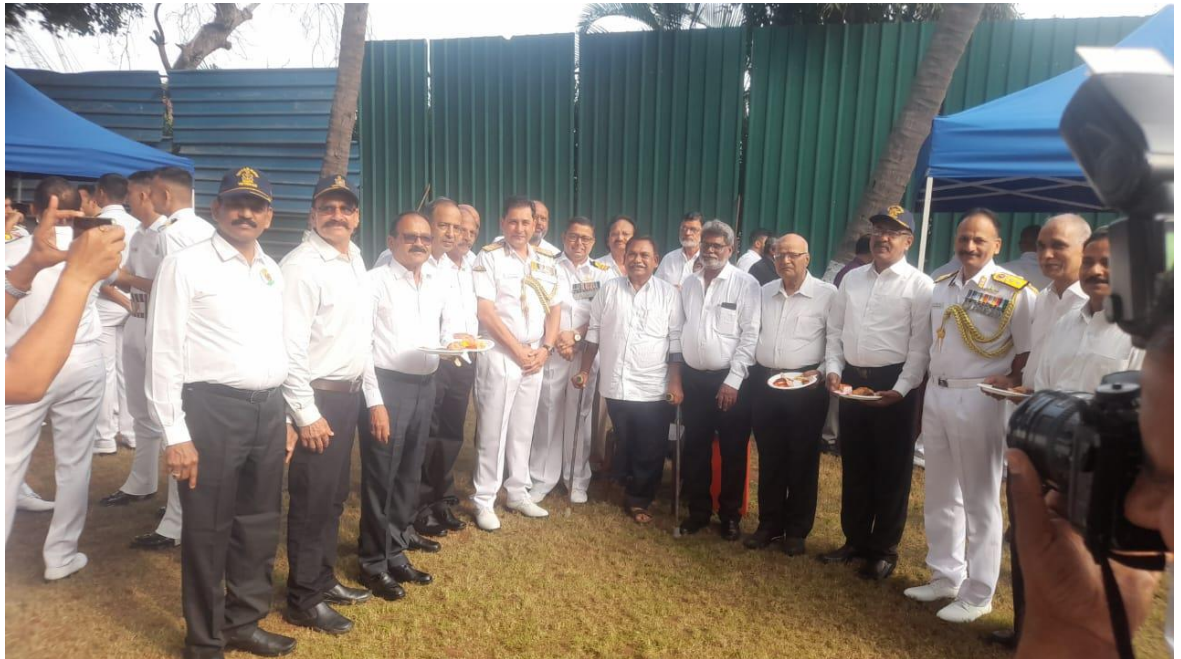
Veterans Interaction at Visakhapatnam on 26 Jan 24