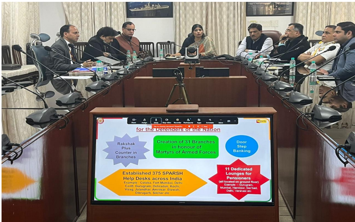
Pre-Retirement Capsule for Retiring Officers from 27 - 29 Feb 24 at New Delhi