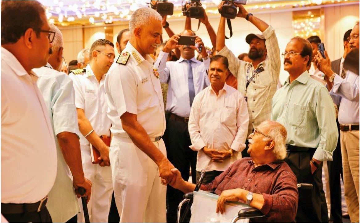
CNS Interaction with Naval Veterans on 27 Feb 24 at Thiruvananthapuram