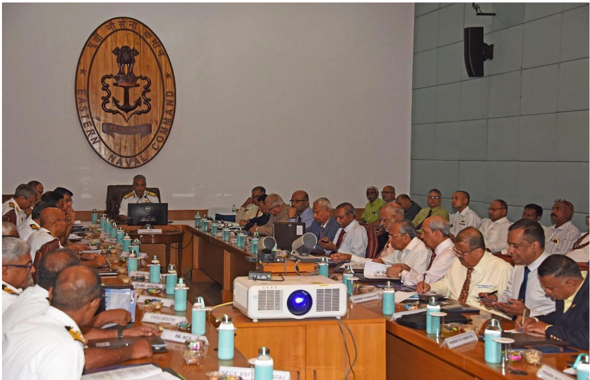
'Samanvay' on 22 Mar 24 at Visakhapatnam