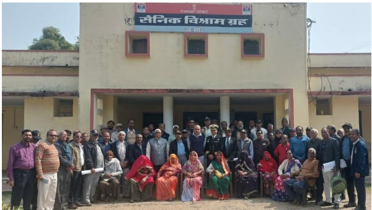
CRSO (C) Interaction with Veterans at ZSB Ajmer on 13 Feb 24