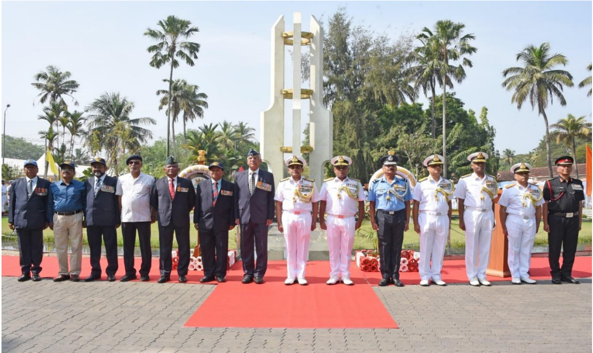
8 th Armed Forces Veterans Day Celebrations on 14 Jan 24 at Kochi