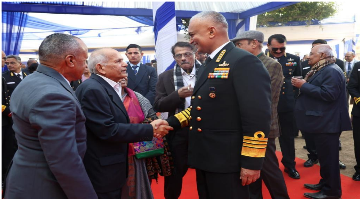
'Samman – 2024', CNS Interaction with Retired Officers on 07 Jan 24 at New Delhi