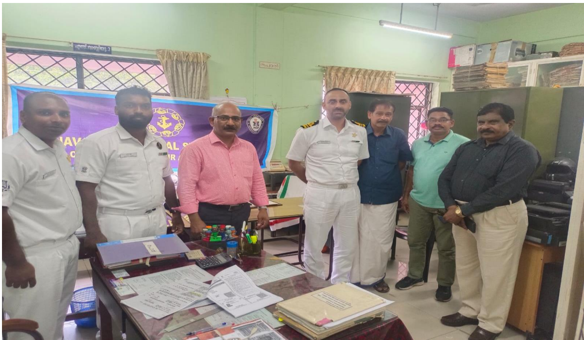
Interaction between HQSNC/ CRSO Staff and Veterans at Kochi