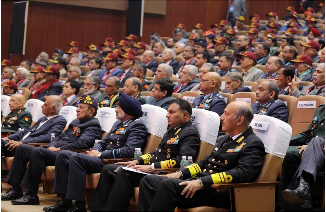
8 th Armed Forces Veterans Day Celebrations on 14 Jan 24 at New Delhi