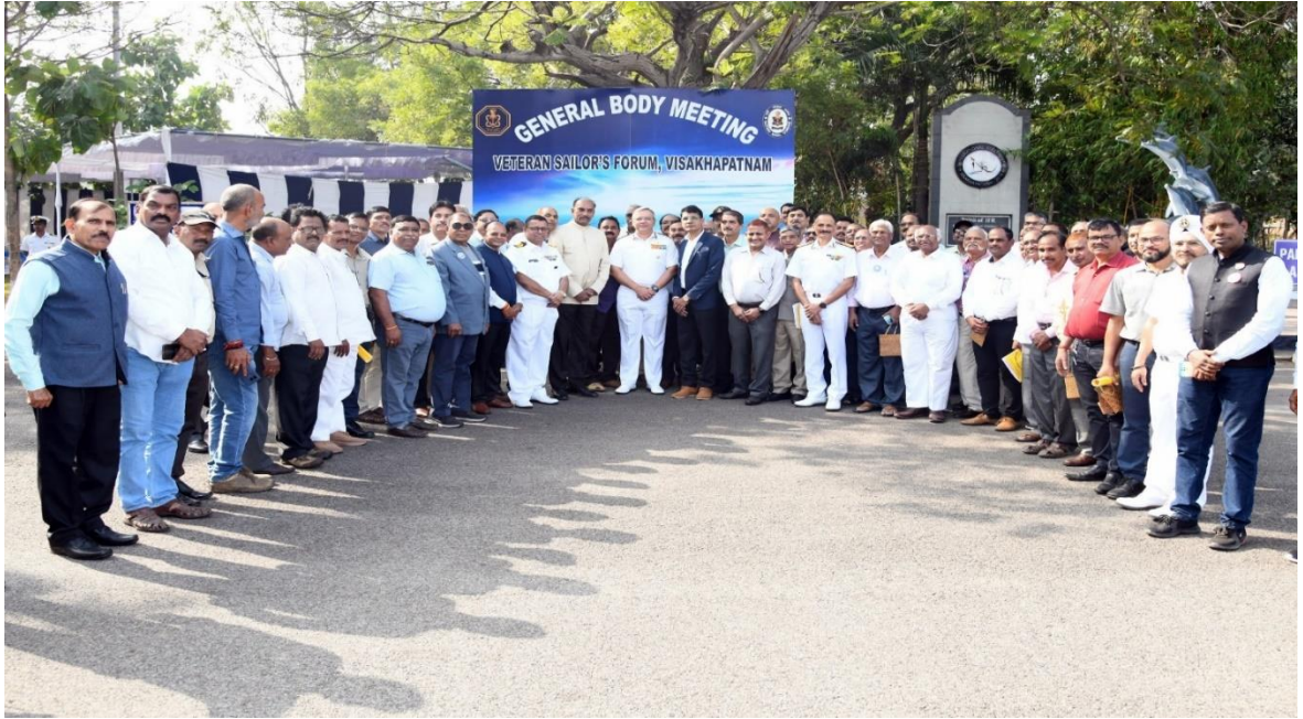
VSF Meeting on 10 Jan 24 at Visakhapatnam