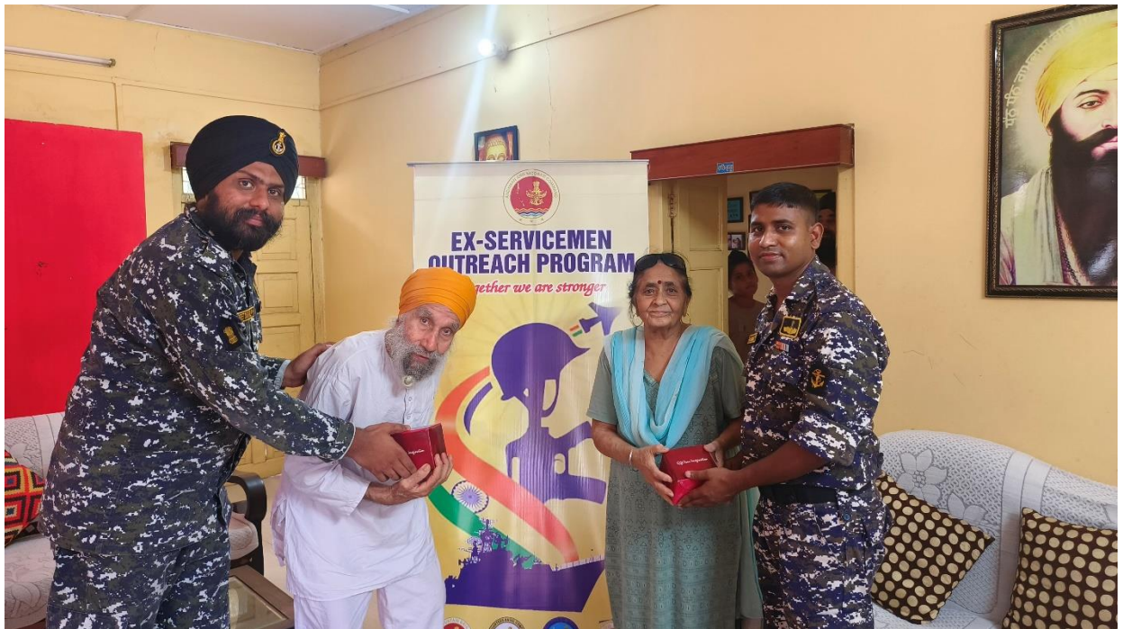
Felicitation of Veterans on 10 May 24 at Port Blair