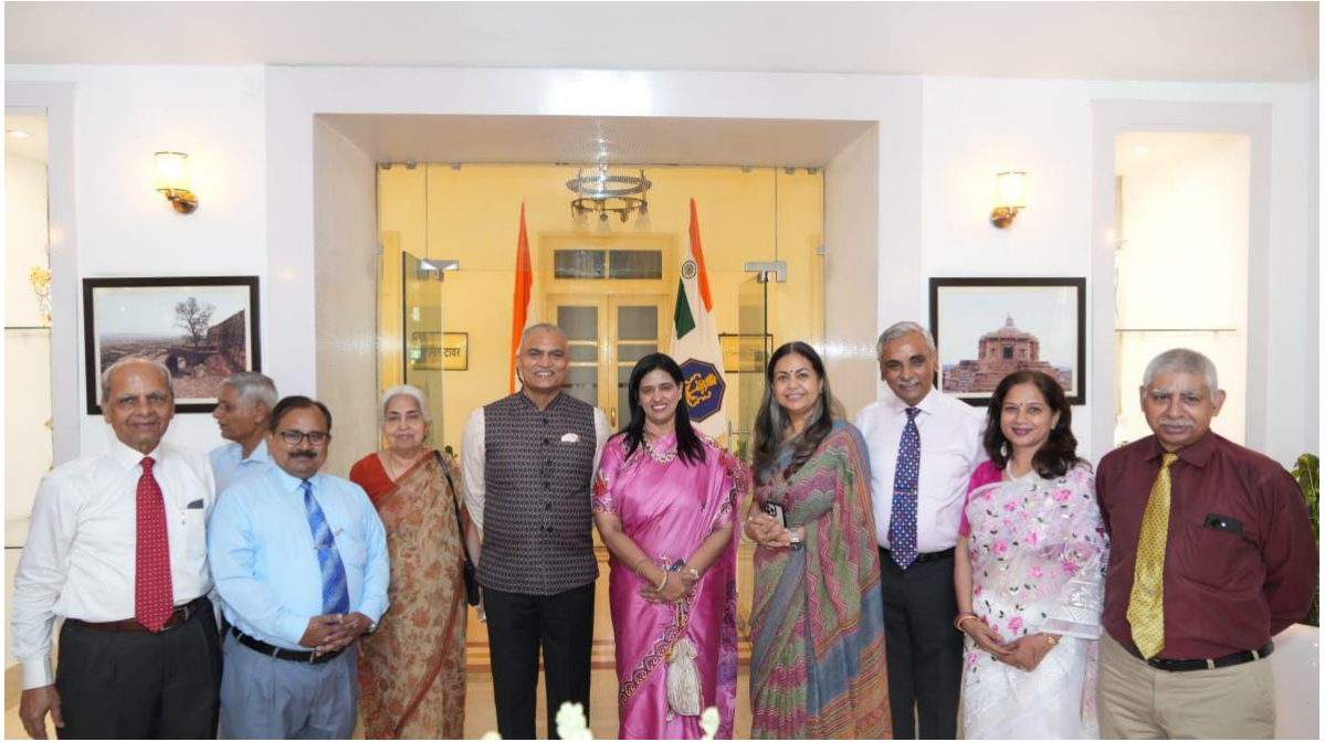
Interaction with Veterans on 20 Apr 24 at New Delhi