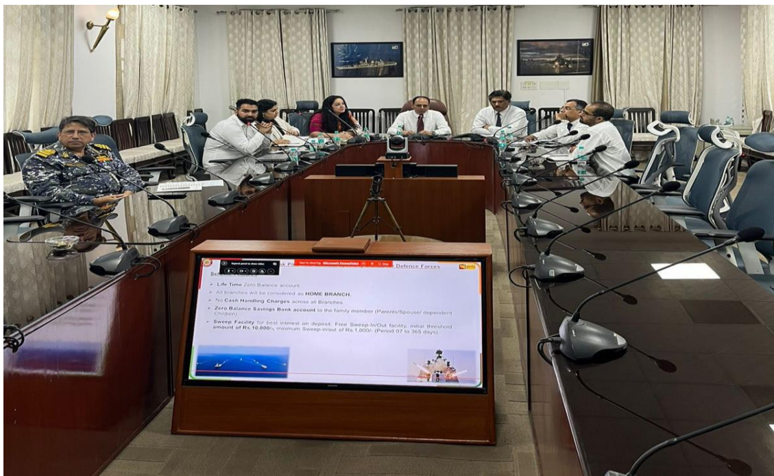
Pre-Retirement Capsule for Retiring Officers from 19 - 21 Jun 24 at New Delhi