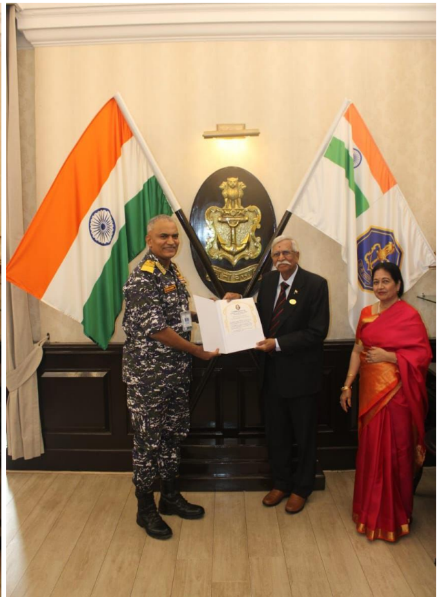
Felicitation of Retired Officers on 12 Apr 24 at New Delhi