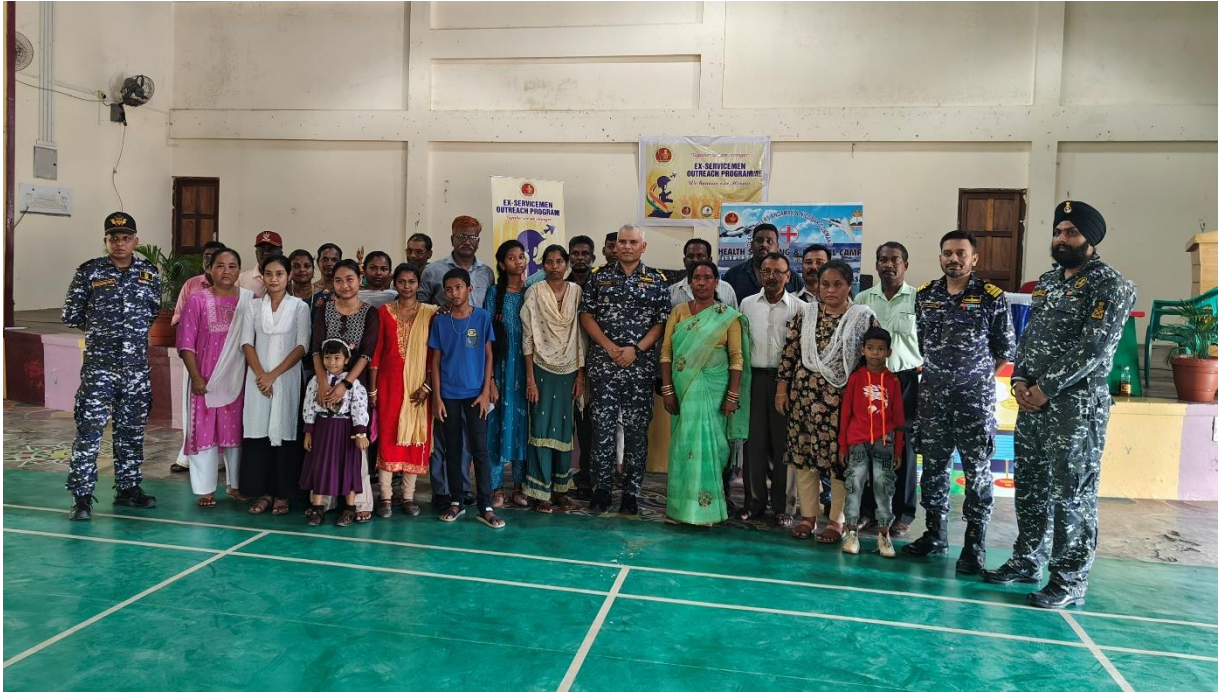
Interaction with Veterans on 10 May 24 at Port Blair