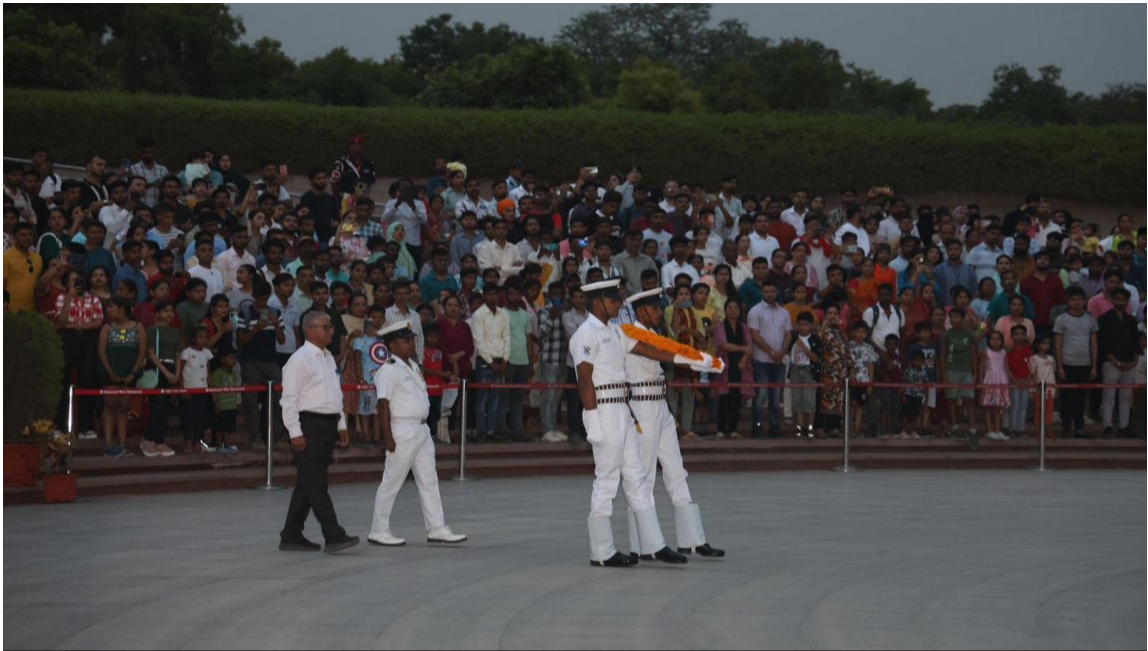
Wreath Laying Ceremony at National War Memorial (01 st of every month)