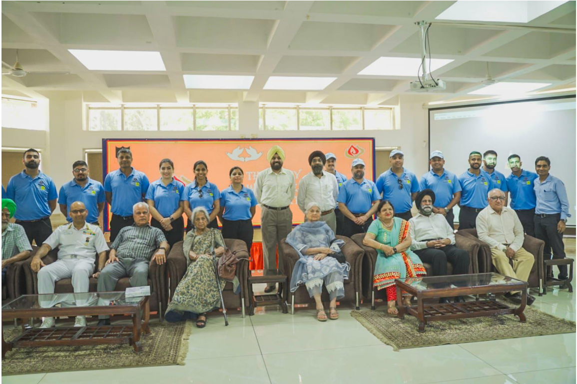
Sindhu Sikhar Car Rally - Interaction with Veterans on 11 Jun 24 at Chandigarh