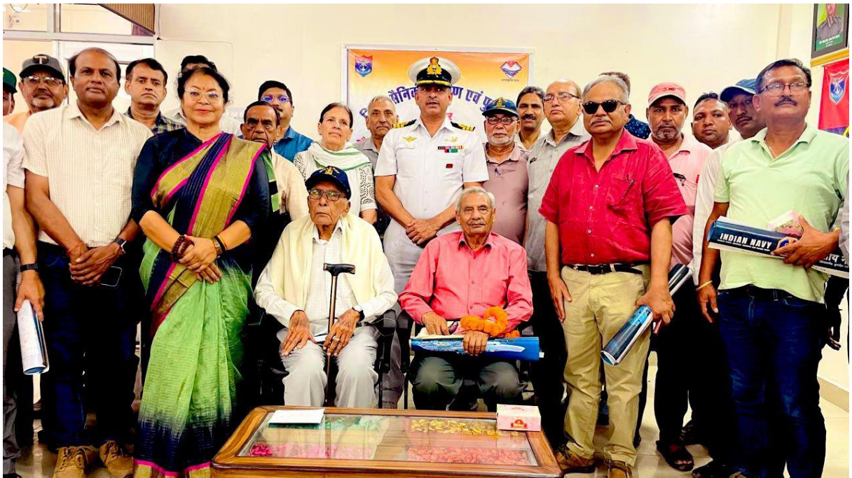
Outreach Programme by CRSO (North) on 29 May 24 at Haridwar