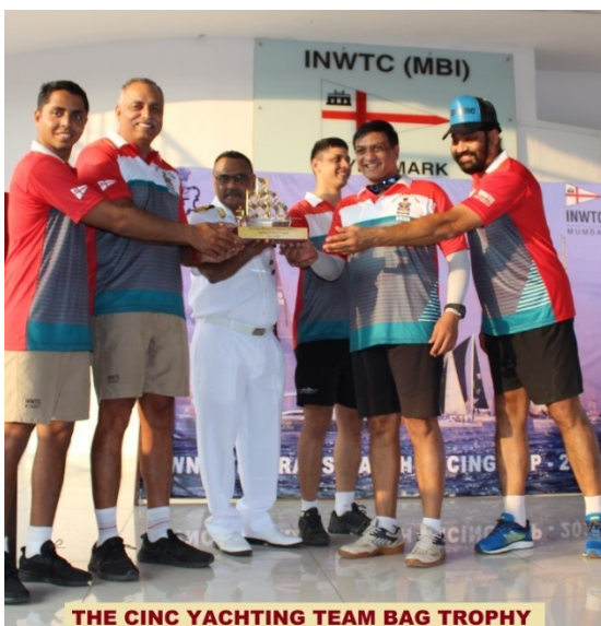
THE CINC YACHTING TEAM BAG TROPHY