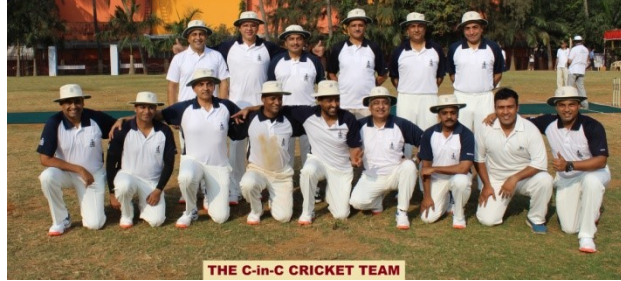
THE C-in-C CRICKET TEAM