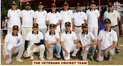
THE VETERANS CRICKET TEAM