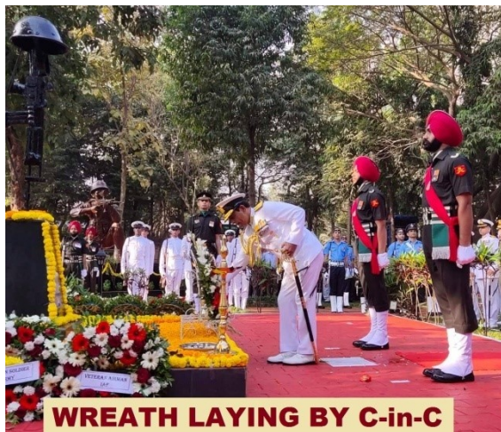
WREATH LAYING BY C-in-C