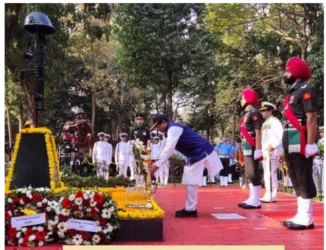
RRM LAYS WREATH