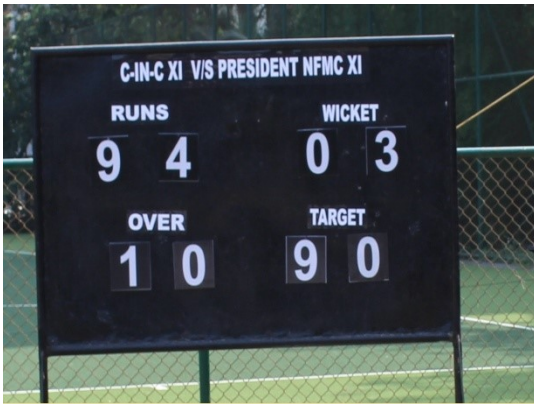
VETERANS SCORE BOARD AFTER WIN