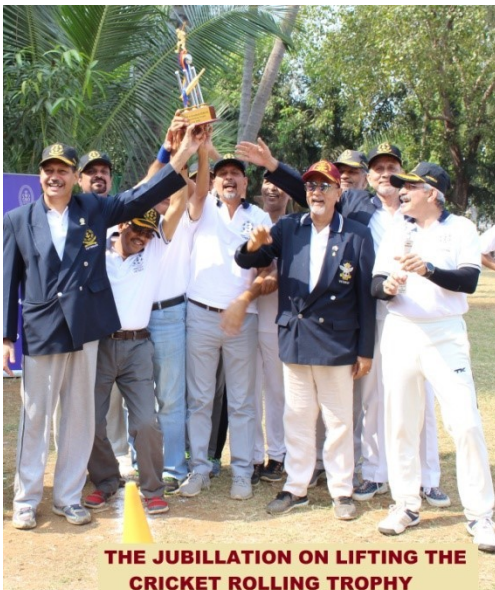
THE JUBILLATION ON LIFTING THE CRICKET ROLLING TROPHY